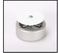
Silver isolator used for white base and black isolator used for black base