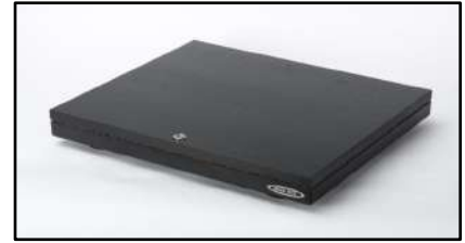
Black oak veneered