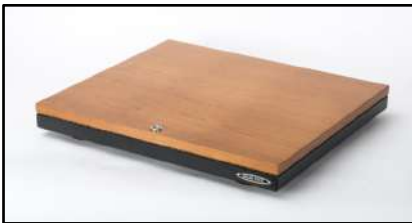
Cherry oak veneered